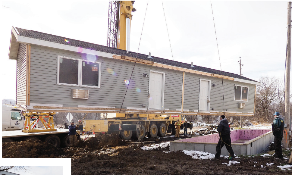
Our company Dynamic Homes built the units that were set by our construction group.

The Winnebago Tribe has a critical housing shortage. Crowded multi-generational housing puts tribal families at a greater risk of getting and spreading COVID-19. Ho-Chunk, Inc.'s homebuilding and construction companies are expanding critical quarantine housing.