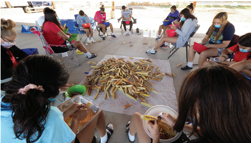
Winnebago Public School volleyball players spoon kernels off traditional Indian corn harvested by Ho-Chunk Farms in 2020.